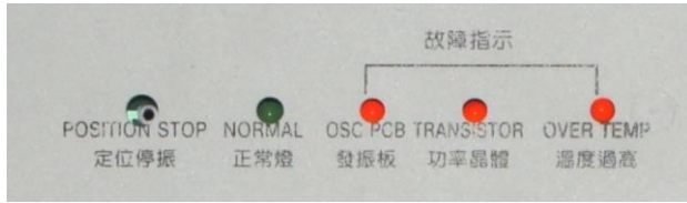
Error Display LED