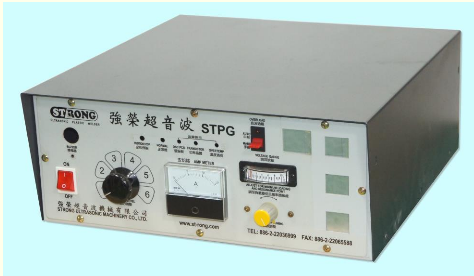
20KHZ Ultrasonic Generator