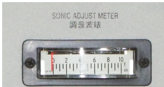
V gauge for Resonance Tuning