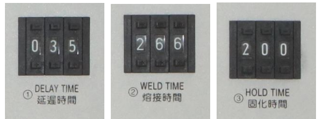
3 digits timer